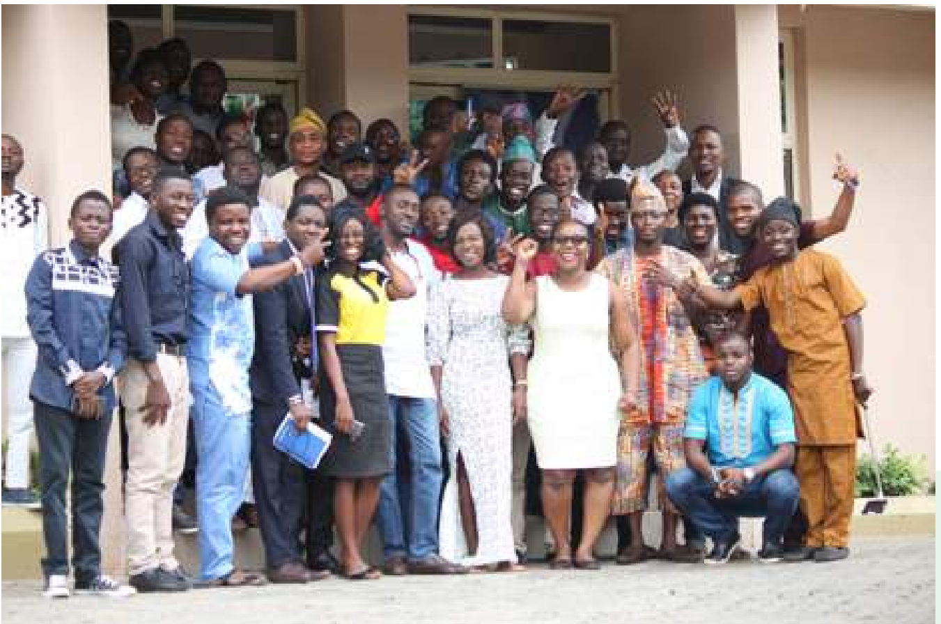
Participants at the Leadership booth Camp program, Ogun state on the final day. 2017

Targeting young people between the ages of 16 to 40 years, TFP is guided by a Strategic Plan from which it derives its quarterly and annual work-plan. This report therefore highlights progress, implemented activities and results achieved for the year 2017.